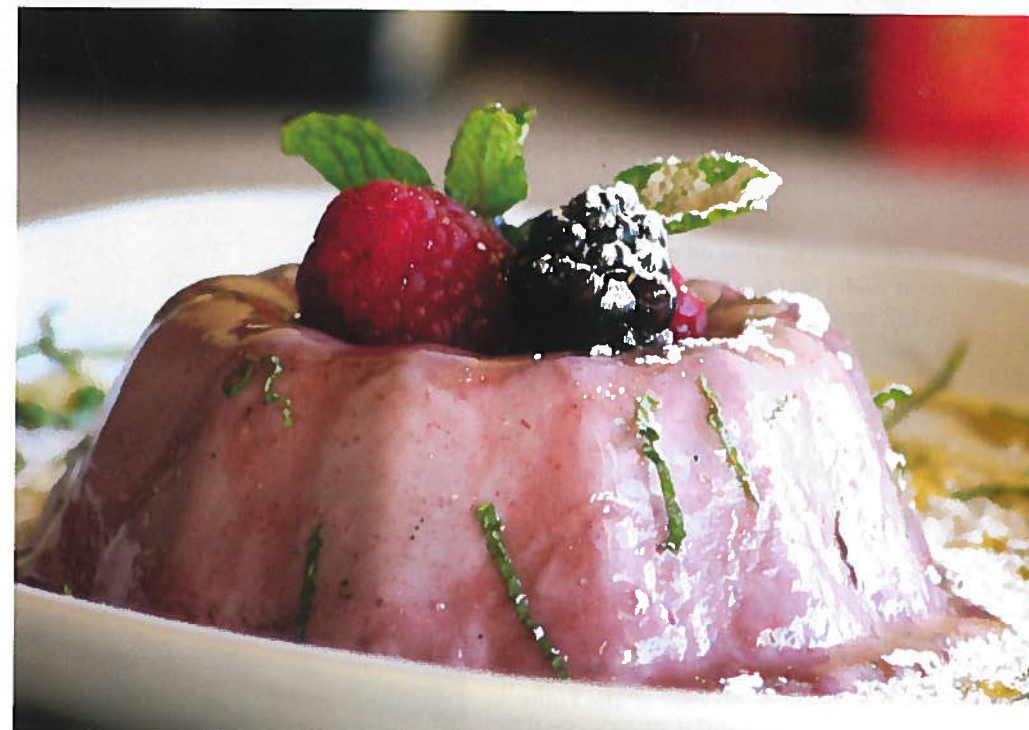
Honey, Crème Brulee, Calzone or Honey Lemon cake.